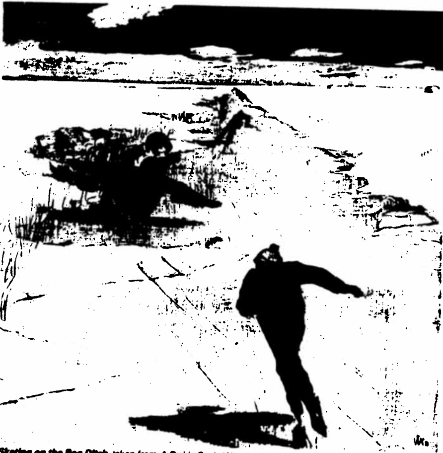
Skating on the Bog Ditch, taken from A Prairie Boy's Winter by William Kurelek. © 1973, published by Tundra Books.

"I had a pretty fair idea of what I was looking for," Uncle Nathan said. "I imagine it was the same sort of thing every young fellow thinks he's looking for, but I thought I had standards. I wasn't willing to settle for just anyone."